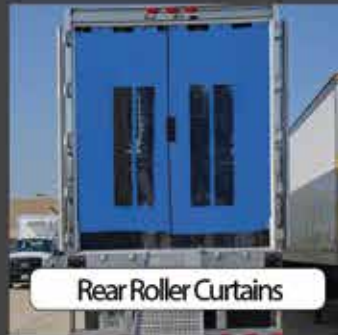
Rear Roller Curtains