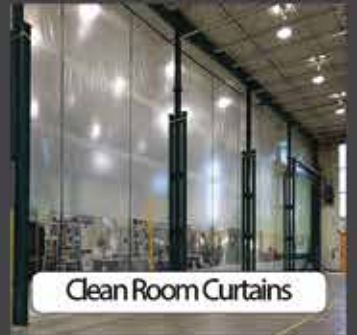
Clean Room Curtains