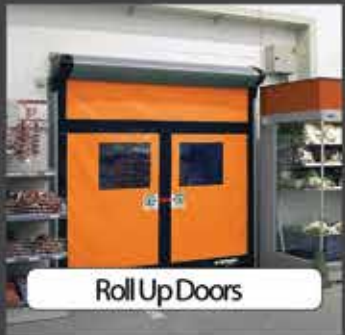
Roll Up Doors