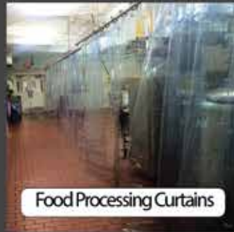
Food Processing Curtains