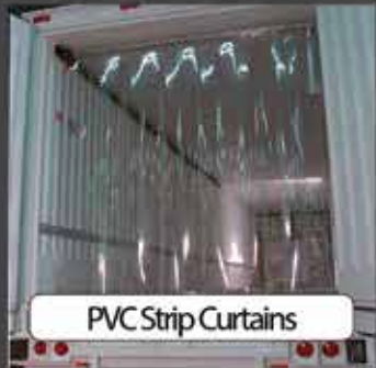
PVC Strip Curtains