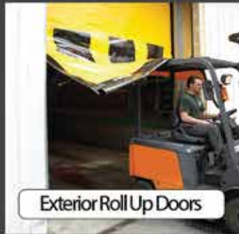
Exterior Roll Up Doors