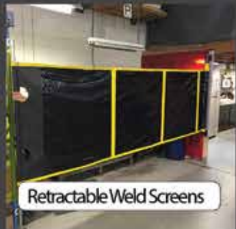
Retractable Weld Screens