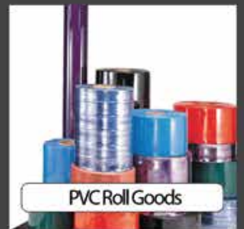
PVC Roll Goods