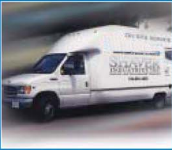
Our fully equipped Mobile Service Unit can repair and refurbish most makes of way covers.