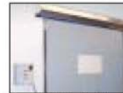
Power Roll-Up Curtains

SHAVER INDUSTRIES INC. Machine and Environmental Protection