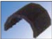
Custom Fabric Bellows

We offer a complete line of machine and environmental protection systems.