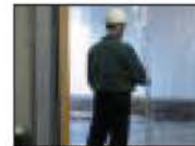
PVC Strip Curtains