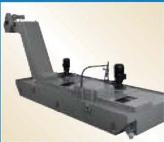
Our CDF systems are equipped with long life, permanent filtration media.