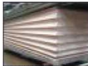
Lift Table Bellows