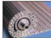
Roll-up Cover and Aprons