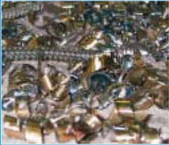
Protect your investment from damaging chips and fines.