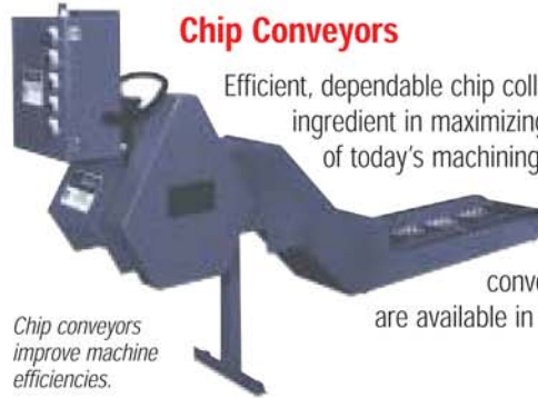
Chip conveyors improve machine efficiencies.

Efficient, dependable chip collection is a key ingredient in maximizing the performance of today's machining centres.