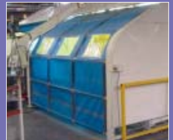
Custom engineered roll-up curtain in a welding environment permitting overhead crane access.