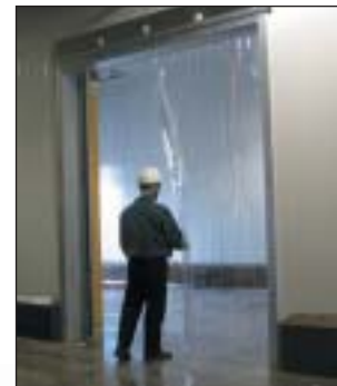
Safe, transparent strips eliminate the risk of being hit by heavy solid swing doors as a result of incoming traffic.