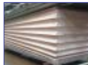
Lift Table Bellows