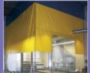
Stationary curtain providing fume containment.