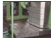
Steel Way Covers