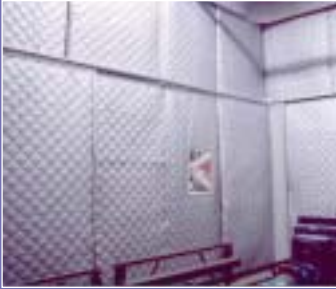
Sound absorption in grinding area.