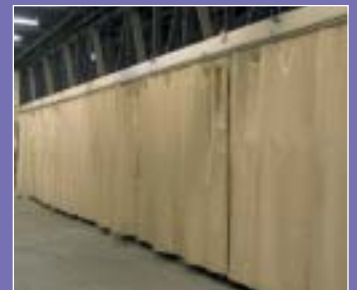
Versatile sliding track system.