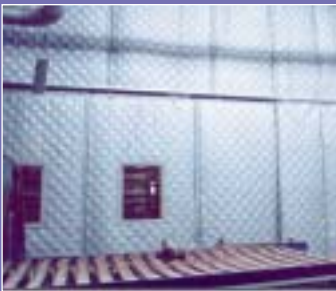
Noise abatement materials are durable and are easily installed by ceiling or floor mounted hardware.