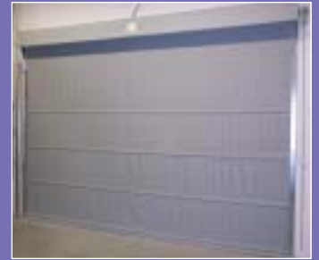
Large roll-up curtains improve plant safety and move out of the way for easy, impact-free access.