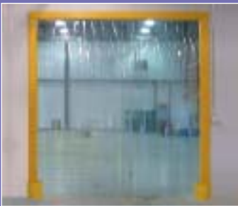
Low temperature grade PVC for cooler and/or freezer applications.