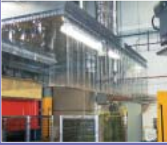
PVC Strip Curtains for fume containment.