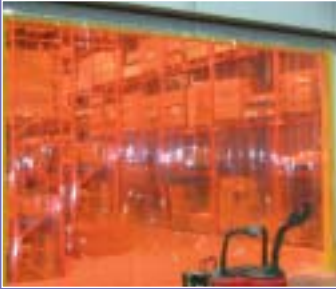
Visual protection in welding area.