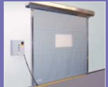
Optional stainless steel components and custom fabrics are available to meet the stringent requirements of food handling industry. Additional features such as a soft bottom safety edge can be added.

SHAVER INDUSTRIES INC. www.shaverinc.com