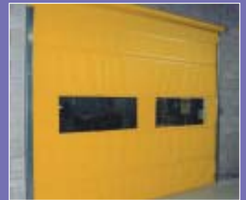
Roll-up curtains are available in a wide range of colors.