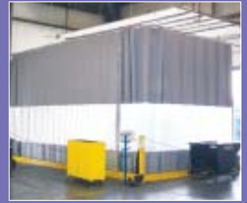
Custom designed curtains for shipping and receiving areas.