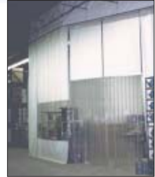
Temperature control in shipping area.

Based on our many years of experience we have developed unique hardware and mounting methods to address difficult applications thus reducing installation cost. Our PVC strips are easy to install with our unique galvanized pre-studded mounting hardware.