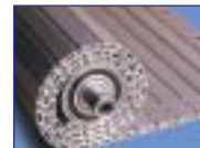
Roll-up Cover and Aprons