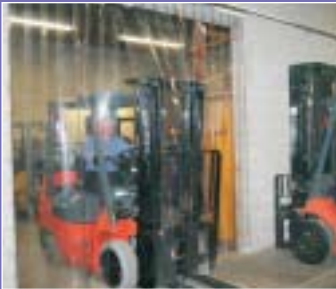
Flexible and robust PVC strips allow easy access while conserving energy.