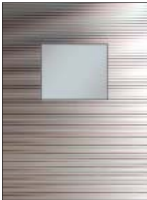
Aluminum guarding for automation or machining centers with or without viewing windows.