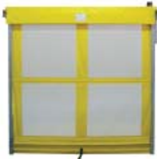
Bug screens are made of flexible mesh allowing fresh air to flow into your facility.