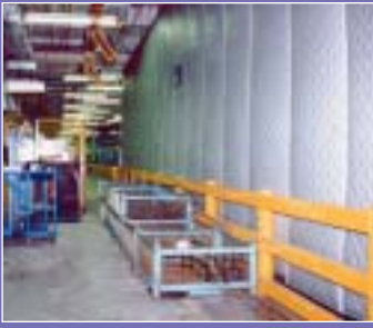
Noise reduction in automotive plant.