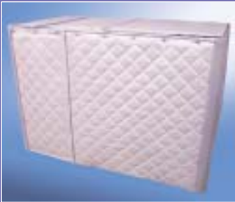
Noise enclosure for compressors.