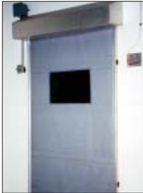
Pedestrian access to climate controlled area.