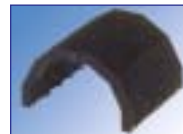
Custom Fabric Bellows

We offer a complete line of machine protection systems.