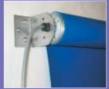
Integrated fully protected low profile motor ideal for wash-down areas or operations that require an absolutely clean environment.

Shaver Industries designs and manufactures a wide range of flexible screens to keep insects, birds and rodents off your premises. In addition, they stop trespassers and provide a more comfortable work environment. Shaver bug screens are custom designed and available in various configurations such as spring loaded roll up, automatic roll up, chain hoist, and sliding track. They are made of durable materials, are easy to install and require low maintenance.