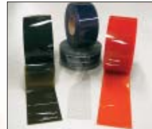
Do-it-yourself rolled goods are in stock and available in different material compositions to meet your specific requirements.

SHAVER INDUSTRIES INC. www.shaverinc.com